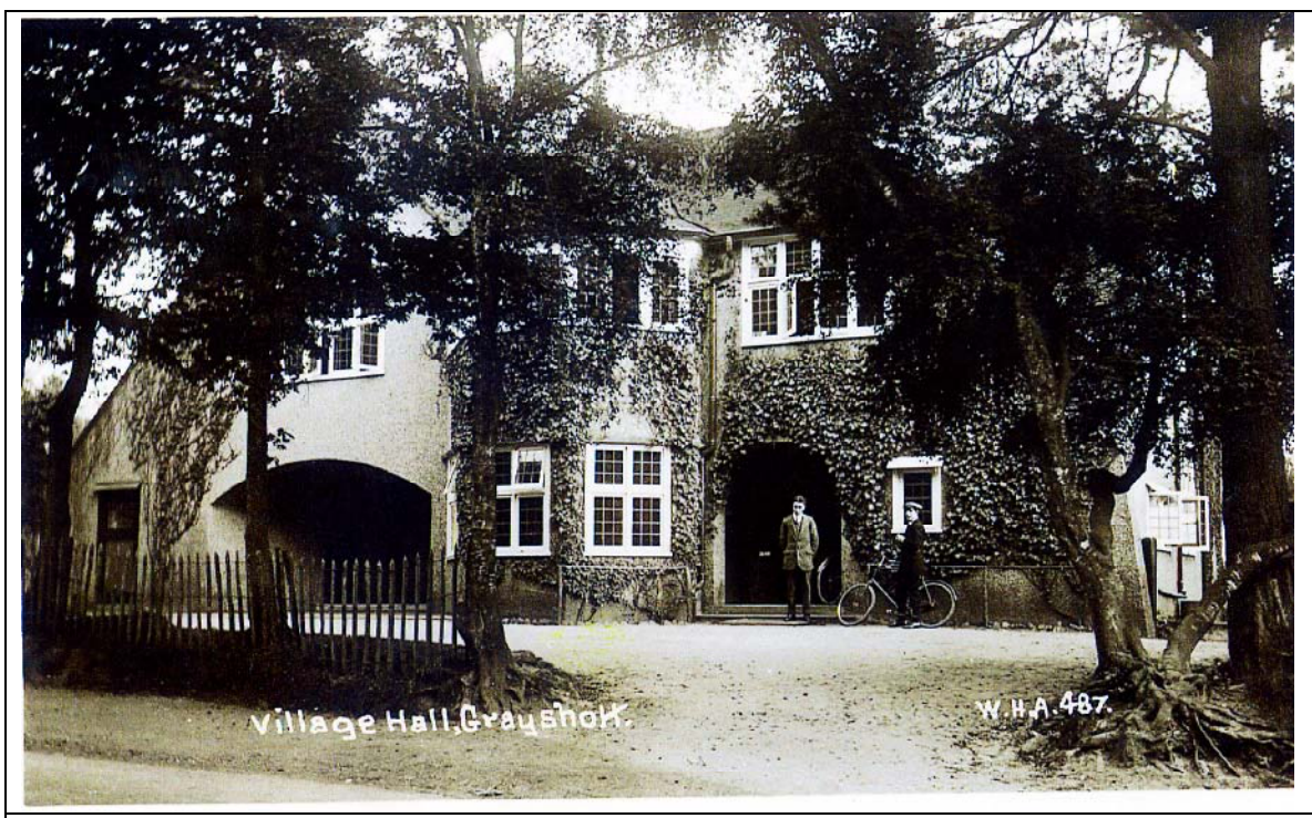
Grayshott and Hindhead Institute and Village Hall c.1911/1914