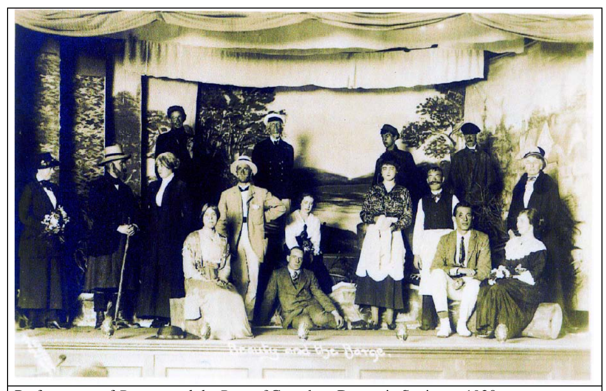
Performance of Beauty and the Barge ?Grayshott Dramatic Society c.1920s